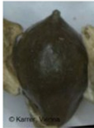
Figure 4: Uncoated nut of Ambrosia artemisiifolia (Karrer et al., 2016c).