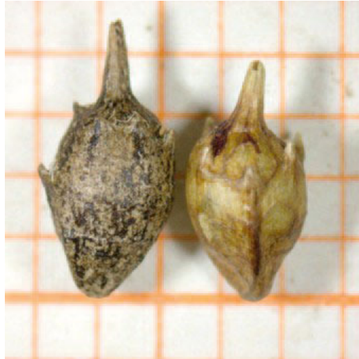
Figure 2: Seeds of Ambrosia artemisiifolia (from Karrer, 2016c). The scale grid indicates 1 cm between the thick orange lines and thin lines show 2 mm increments

vary from 2.5 to 5 mm (Hall et al., 2021), the width varies from 1.5 and 3.0 mm (lowest value: 1 mm 7,8 ). The seed weight also varies a lot: Hall et al. (2021) showed mean weights of A. artemisiifolia seeds between 3.7 and 8.8 mg differing by years of sampling (min: 1.0 and max. 13.5 mg). Ortmans et al. (2016b) found that seed mass varied with population origins (in Western Europe) and with mother plants from 2.1 to 12.7 mg. On tall mother plants on average smaller seeds were counted compared to small individuals with fewer but bigger seeds. Interestingly, Leiblein-Wild et al. (2014) found that in their experiments, the single seed mass of seed lots from the native range were on average lower than those in the invasive European range what was also correlated with higher frost tolerance of the European origins.