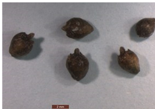
Figure 3: Seeds of Ambrosia psilostachya .

Ambrosia psilostachya is documented as agricultural weed only from southern France (Fried et al., 2015; Karrer et al., 2023) but was never reported as crop seed contamination. The seeds are of the same size like in A. artemisiifolia but the spines are less distinct or even missing in several cases (Figure 3).