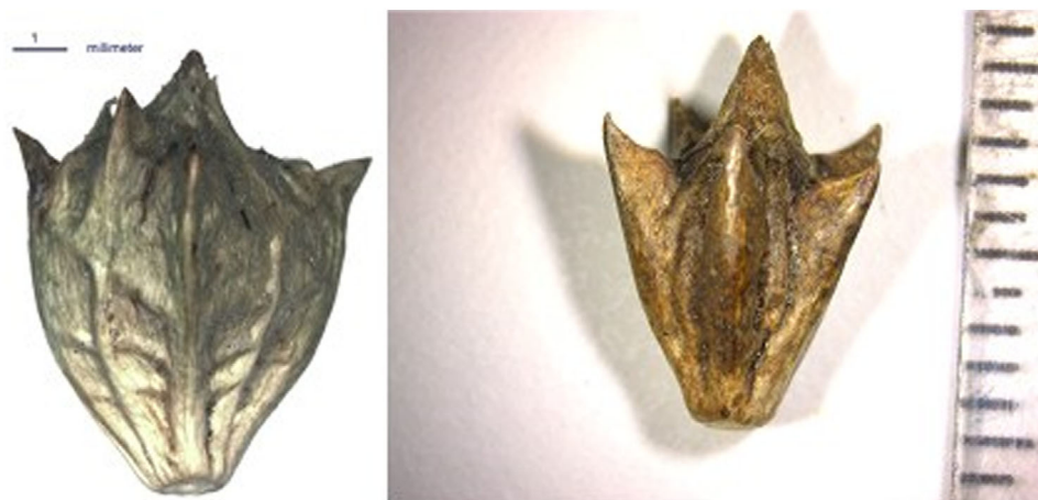
Figure 1: Seeds of Ambrosia trifida (from Karrer et al., 2016c). The ruler showing mm scale applies to the right image only

Easy to identify are seeds of Ambrosia trifida having very big seeds (0.5–1.1 cm) in length with 2–3 not very sharp spiny appendices (Figure 1).