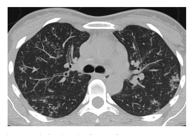
Fig. 4–Atypical CT imaging features for COVID-19 pneumonia. Axial unenhanced chest CT image of the lungs in a 37year-old control patient showing tree-in-bud opacities and centrilobular nodules, caused by active tuberculosis.