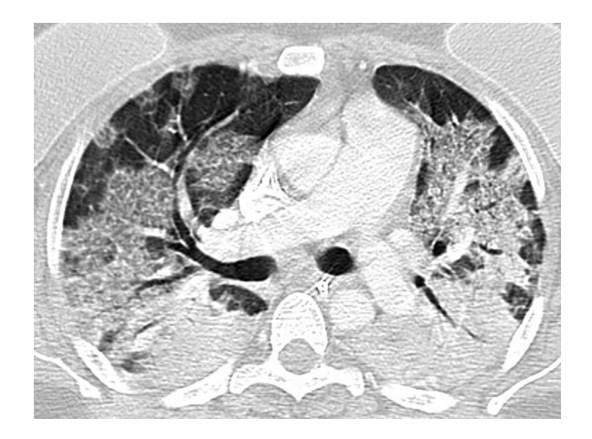
Fig. 3 – Indeterminate CT imaging features for COVID-19 pneumonia. Axial contrast-enhanced chest CT image of the lungs in a 41-year-old female with a positive RT-PCR, showing bilateral widespread GGO with nonrounded morphology and no specific distribution with areas of consolidation.

Another possible reason is the undervaluation of said symptoms in the pre-pandemic context, especially when of mild or vague nature, or even when linked with chronic conditions. Nevertheless, differential diagnosis is not restricted to infections of obvious presentation or of infectious etiology,<sup>4</sup> which in our opinion justifies the inclusion of patients without explicitly reported signs/symptoms. We also recognize that there is concern that the control patients and settings do not ideally match the review question, but we understand that it is an unavoidable issue given the case-control selection nature of the study. The limit of seven days between RT-PCR sampling and CT scanning for the COVID-19 group may also