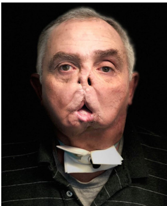
Fig. 1 Recipient prior to face transplant

Over the course of the next three years, the multidisciplinary team outlined the medical, surgical, and logistical steps required to ensure success. 8 The team was able to secure provincial, federal, and institutional support, as well as private funding, for the procedure. The provincial organ procurement organization (Transplant Quebec) worked closely with the transplant team to ensure ethical and transparent handling of potential donor patients and their families. Stringent guidelines for inclusion and exclusion criteria were established for potential donors. Ethics approval for the procedure was granted from Health Canada, Transplant Quebec, as well as our University (University of Montreal) and hospital (Maisonneuve-Rosemont Hospital).