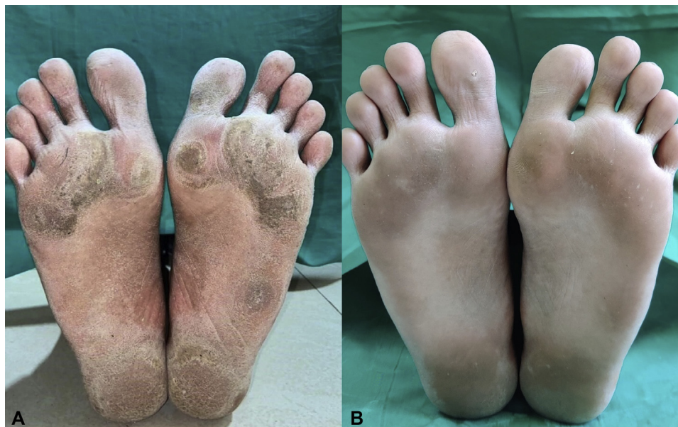
Fig 2. Photographs before and after treatment. A , Hyperpigmented hyperkeratotic plaques with scaling present on both soles. B , Lesions resolved completely after treatment.

the ventral subarachnoid space. A diagnosis of PD secondary to second-line antitubercular therapy, ethionamide, and/or pyrazinamide was made. He was treated with oral nicotinamide 250 mg thrice a day with a multivitamin complex containing 50-mg nicotinamide, 2 tablets thrice a day, which resulted in the complete resolution of skin lesions (Figs 1, B; 2, B; and 3, B) as well as neuropsychiatric symptoms 12 weeks later.