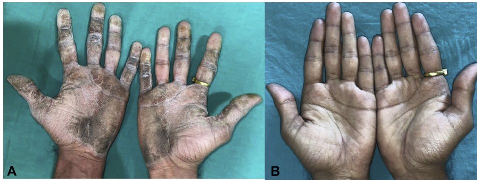
Fig 1. Photographs before and after treatment. A , Hyperpigmented hyperkeratotic plaques with scaling present on both palms. B , Lesions resolved completely after treatment.