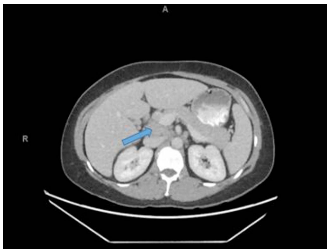
Figure 1. Abdominal computed tomography with an arrow pointing to the enlarged portacaval lymph node.

She then underwent percutaneous liver biopsy that demonstrated cholestatic hepatitis with prominent bile duct injury with inflammation and increased fibrosis (stage 1/4) (Figure 2). She was started on prednisone 20 mg once daily for possible autoimmune hepatitis and ursodiol 300 mg 3 times daily for possible primary biliary cholangitis, neither of which led to an improvement in symptoms.