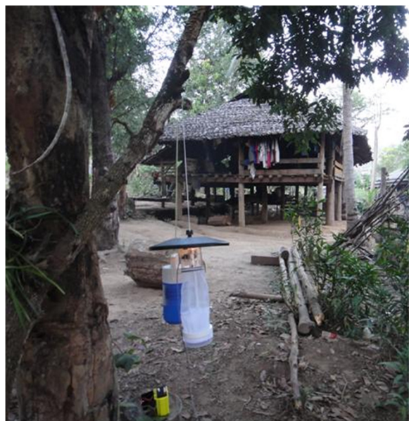
Fig. 2 CDC light trap setting. The CDC light traps with and without 1 kg of dry ice were set by hanging them in about 1.5 meter height either indoors and outdoors (10–20 meters from house), overnight (6.00 pm–6.00 am.). Mosquitoes were collected daily in the early morning

no dry ice. The locations of the traps were recorded by GPS (Garmin GPSMAP 60CSx, USA). Mosquitoes were collected from the traps each morning and sent to the laboratory (Department of Medical Entomology, Faculty of Tropical Medicine, Mahidol University, Bangkok) for analysis. Mosquito species were determined based on morphological characteristics [18–21]. Mosquito blood meal status (empty, blood fed, half gravid, and gravid) was also recorded.