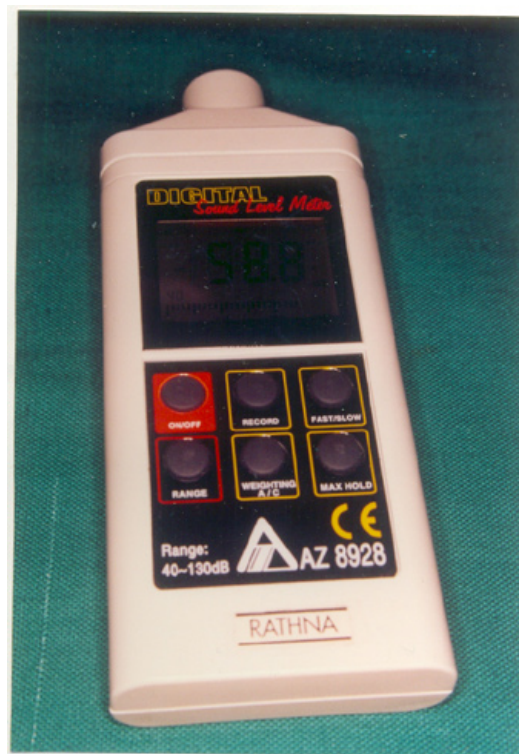
Fig. 1. Decibulometer or Sound Level Meter used to measure noise emitted by different dental equipments.

“decibulometer” or a “sound level meter” (Fig. 1) with a mounted microphone directed towards the source of sound in different teaching and learning areas. In each area the noise level was assessed at two positions-one, at 6 inches from the operators ear to simulate the noise reaching the ear drum and second, at the chairside instrument trolley to simulate the noise reaching the person standing nearby, although in decreased intensity. The purpose was to find out the noise levels in the immediate vicinity of the working area of the operator. This standardized instrument was obtained from the Manipal Institute of Technology, Manipal. The investigator was calibrated by training sessions in the correct use of the decibulometer from the concerned personnel of the Manipal Institute of Technology, Manipal. At all times, the decibulometer was used according to manufacturer’s recommendations.