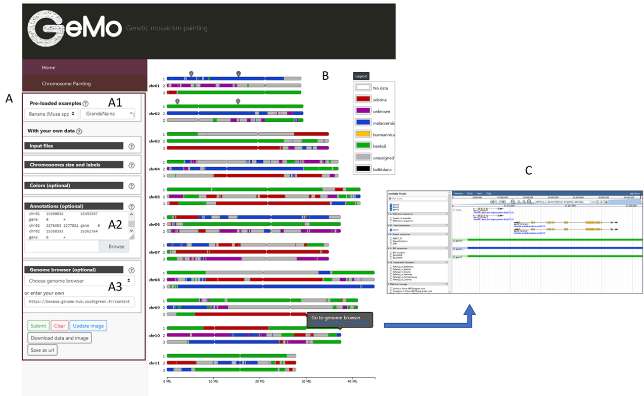
Figure 1. Overview of the GeMo visualization interface representing the genome ancestry mosaics of the triploid cultivated banana ‘Grande Naine’ (13). (A) Menu panel allowing the user to load their own data or to visualize preloaded data (A1). (B) Predicted mosaic structure for the 3 × 11 chromosomes as proposed in (13). Each color on the chromosomes represents a genetic group, except dark gray for undefined genomic block. Symbols on chr01 and chr02 indicate genomic features (such as gene of interest, QTLs, etc.) entered by users based on genomic coordinates of the reference genome used to draw the genome ancestry mosaics in the menu entitled ‘Annotations’ in A2. (C) Automatically exported dataset from GeMo by clicking on a block and imported as a track to the JBrowse configured in the Genome Browser menu in A3.