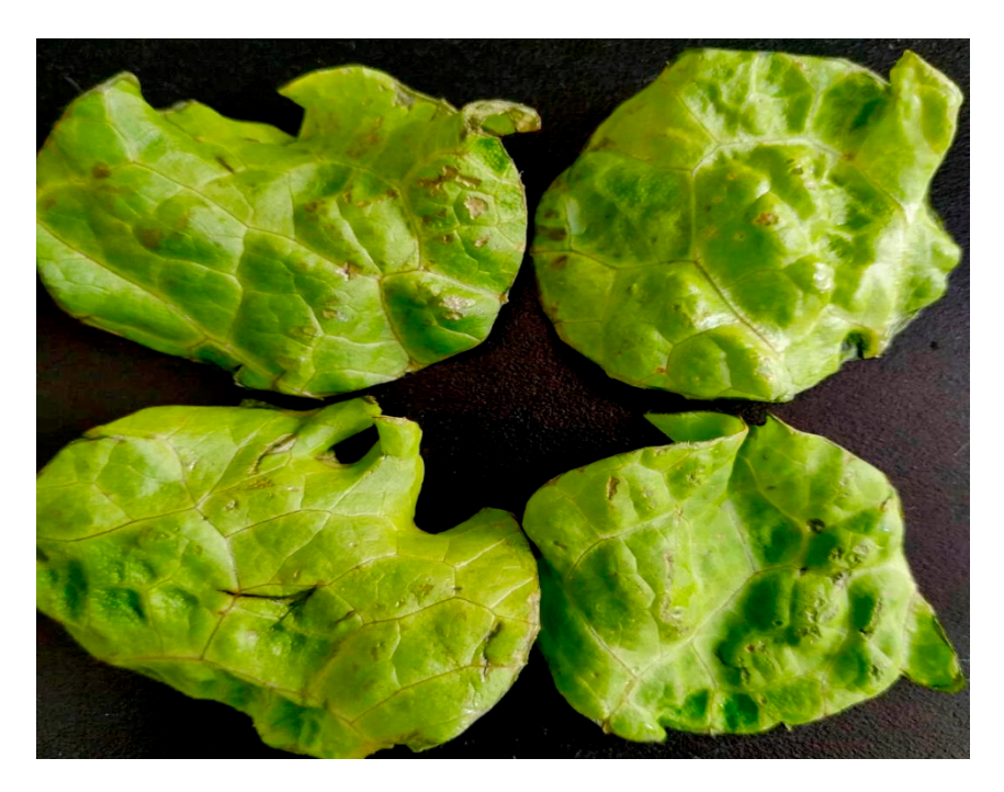
Figure 1. Visual quality-loss of lettuce samples after washing with 1% acetic acid and storage for 5 days.

Values are expressed as mean \pm standard deviation. Different letters in the same column indicate significant differences (p < 0.05). AA, acetic acid; LA, lactic acid; GAE, gallic acid equivalent.