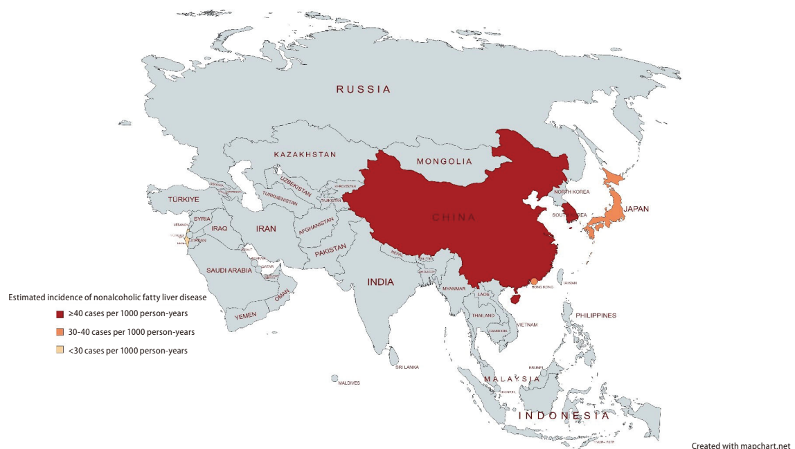
Figure 1. Estimated incidence of nonalcoholic fatty liver disease. Data for China, Hong Kong, Japan, and South Korea was obtained from Li et al. 10 and Riaz et al. 3 . Data for Israel was obtained from Riaz et al. 3 and Younossi et al. 9 . NAFLD, nonalcoholic fatty liver disease.

Riaz et al. 3 pooled data from 72 studies (1,030,160 individuals) and estimated that the global prevalence of NAFLD in adults was 32% (Table 2). The prevalence was higher in males than females (40% vs. 26%, P < 0.0001 ). The prevalence of NAFLD increased from 26% in studies from 2005 or earlier to 38% in studies from 2016 or beyond. However, data from this study by Riaz et al. 3 requires cautious interpretation, as data were available from only 17 countries, hence it is unclear if the estimates from this study are a true reflection of 'global' prevalence. The relative lack of studies emphasizes the need to improve data collection from regions such as Africa, Oceania, and South America, where data was lacking. Le et al. 12