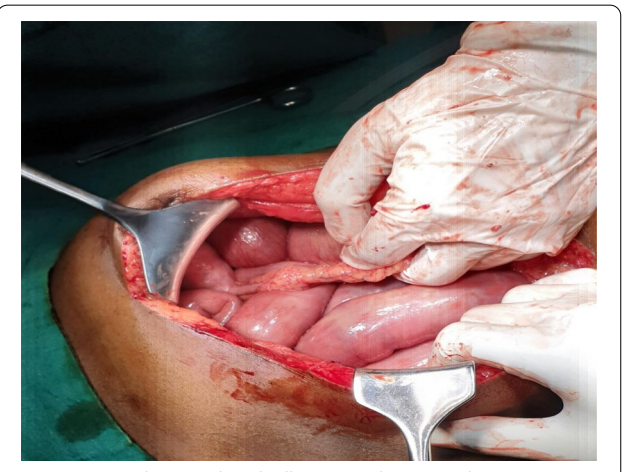
Fig. 1 First exploration: band adherent to the appendix