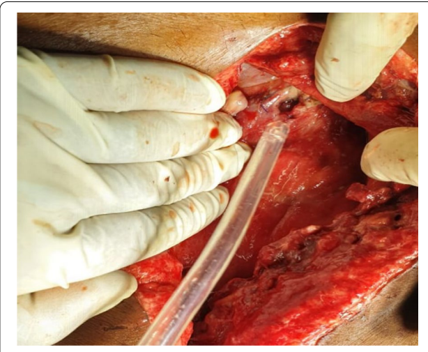
Fig. 3 Leak from the gastrojejunostomy site in the third exploration

and he ultimately succumbed to the illness on day 23 of the first surgery.