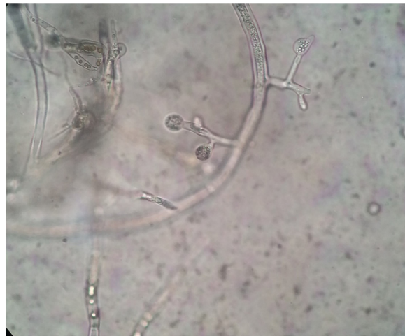
Figure 3 Slide culture revealed spherical sporangia, long and hyaline hyphae, and rhizoids with no distinguishable stolons ( \times 400 ).

Complete blood cell count showed a mild anemia. Plain computed tomography (CT) scan and enhancement showed a soft tissue shadow without a distinctive border. The craniofacial bone was intact. Histopathological examination of tissue biopsy with hematoxylin and eosin revealed ribbon-like, nonseptate hyphae characteristic of a mucoralean fungus in multinucleated giant cell (Fig. 2). The bacterial culture isolate harbored the wild-type resistant phenotype of K. pneumoniae . Microscopic examination of the slide culture revealed spherical sporangia, long and hyaline hyphae, and rhizoids with no distinguished stolons (Fig. 3). Biomolecular identifications were confirmed by