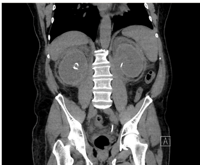
Fig. 1. CT KUB December 2021. Bilateral rind like perinephric structure, ‘hairy kidney’. Ureteric stents insitu bilaterally.

also demonstrate ‘foamy histiocytes’, which are diagnostic of ECD. 3