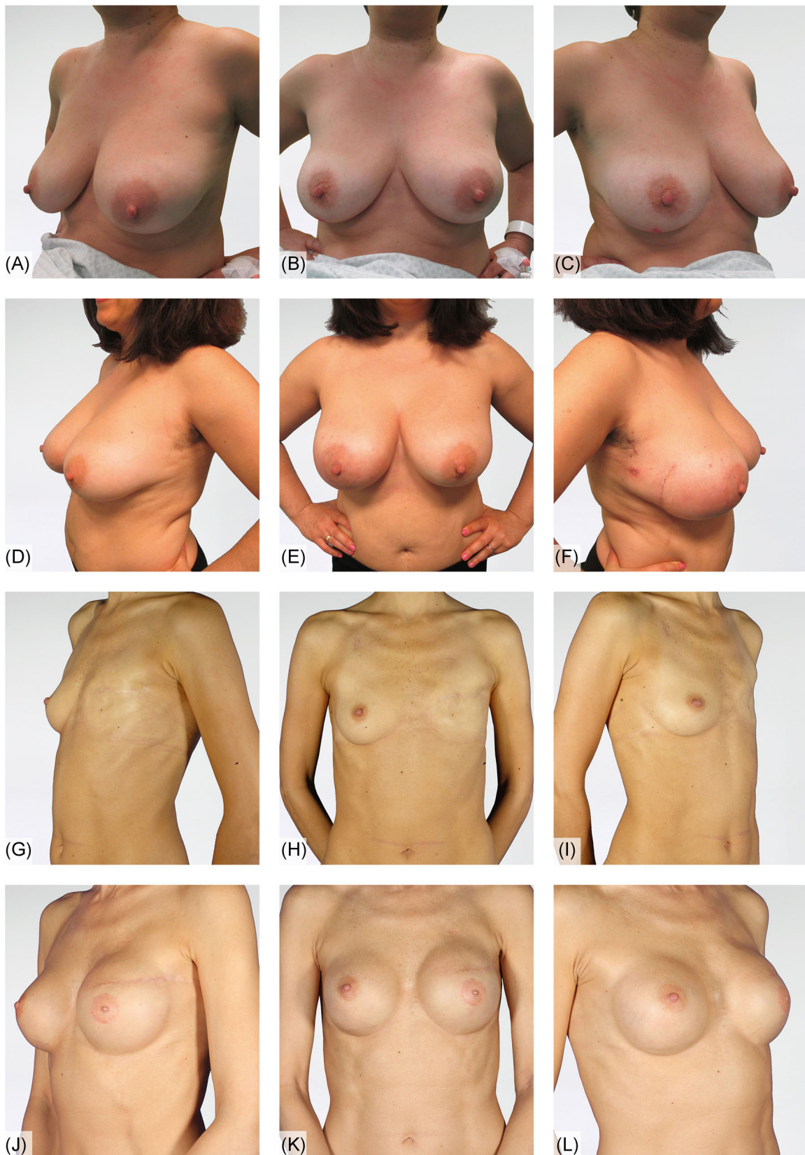
FIGURE 4 A-C, Preoperative lateral and frontal pictures of a right DCIS case; D-F, esthetic result after 6 months of right immediate prepectoral reconstruction; G-I, preoperative lateral and frontal pictures of a failure of previous left breast reconstruction; J-L, outcomes of left delayed prepectoral breast reconstruction, 24 months postoperative. DCIS, ductal carcinoma in situ [Color figure can be viewed at wileyonlinelibrary.com ]