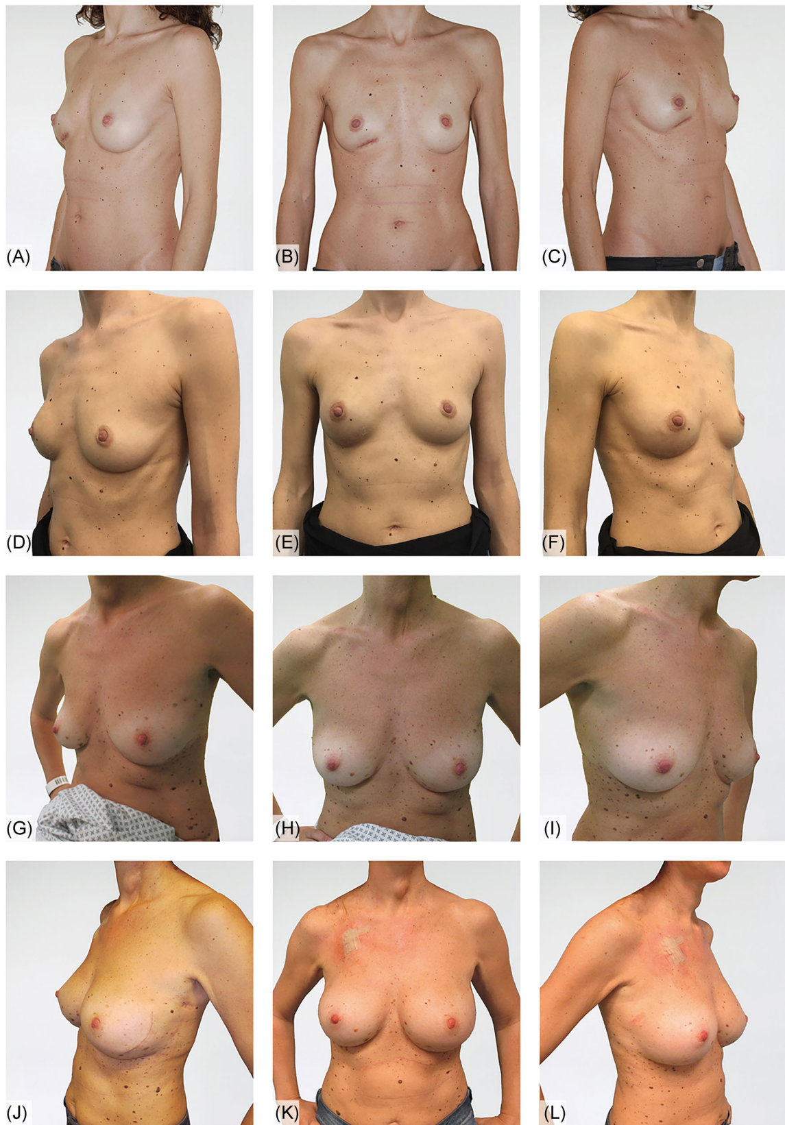
FIGURE 2 A-C, Preoperative pictures in lateral and frontal view, slight asymmetry of the right breast due to a previous clinical investigation; D-F outcomes at 21 months of unilateral right nipple-sparing mastectomy and prepectoral breast reconstruction with Braxon; G-I, preoperative lateral and frontal views of an IDC left case; J-L, outcome of left immediate prepectoral reconstruction after nipple-sparing mastectomy and right breast augmentation, 7 months postop. IDC, invasive ductal carcinoma [Color figure can be viewed at wileyonlinelibrary.com ]