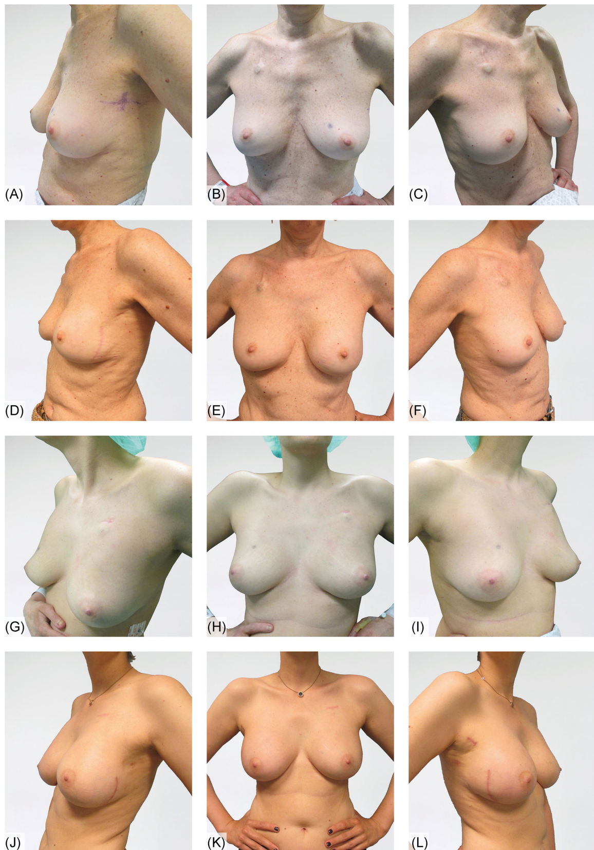
FIGURE 3 A-C, Preoperative lateral and frontal views; D-F, 12 months postop outcomes of left immediate prepectoral breast reconstruction; G-I, frontal and lateral views of right IDC case; J-L, 7 months from the bilateral prepectoral reconstruction after nipple-sparing mastectomies [Color figure can be viewed at wileyonlinelibrary.com ]