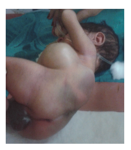
FIGURE 2: Left congenital lumbar hernia with ARM and vertebral defect.

After routine investigations, patients were taken up for surgery. 2 of the patients are waiting for the surgery as they are less than 6 months of age. 1 patient was lost to follow-up and hence could not be operated on. All the rest of the cases were managed with open surgical repair. Surgery was done under general anaesthesia. Skin incision was given along with the sac and the defect was identified. Sac was opened; contents were identified and reduced. In most of the cases, small intestine and large intestine comprised the hernial sac contents. However in one of the cases kidney was the sac content. Defect was repaired using local healthy fasciomuscular tissue. In our study, 2 cases had large defect (7 \times 7 \text{ cm}) , where meshplasty was done with drainage (Figure 5). In postoperative period, patients were started orally after 1 day and discharged after day 7. Stitches were removed on day 10. In case of meshplasty, drain was removed after 72 hours. Wound infection was seen in 2 cases which were managed with local dressing and antibiotics. There was no mortality in our series. All the operated on cases are doing well on follow-up with no evidence of recurrence of hernia. They are being followed up