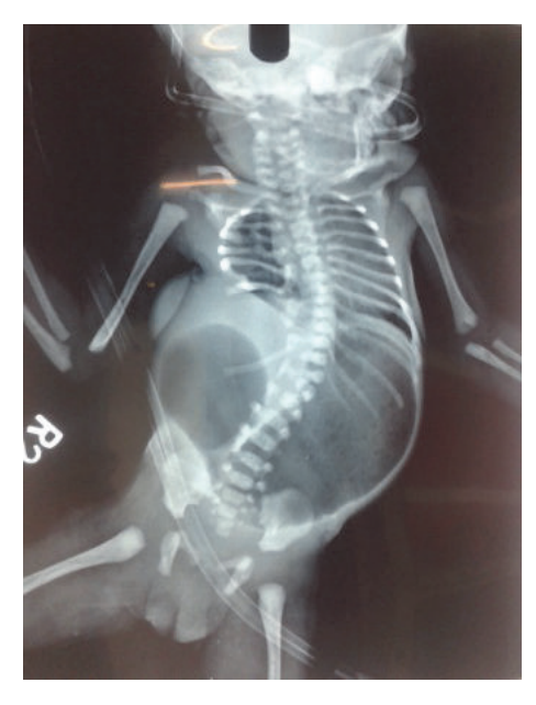
FIGURE 4: X-ray showing congenital lumbar hernia associated with duodenal atresia and lumbocostovertebral syndrome.