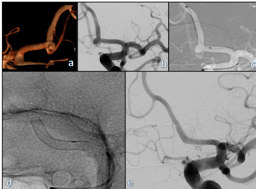
Fig. 2 A representative case for treatment of a small, broad-based aneurysm of the left anterior cerebral artery at A1/2 junction with a single p48 MW device and complete obliteration of the aneurysm on the first follow-up. a 3D volume rendering of the rotational angiography; b working projection; c navigation of a 0,021" microcatheter into the A2 segment; d the p48 MW device in situ; e first angiographic follow-up

The potential of FDS for the treatment of aneurysms distal to the terminal ICA was explored prior to the