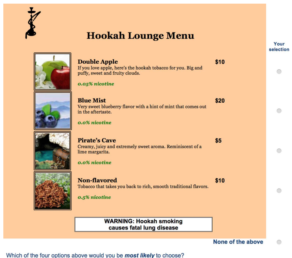
Figure 1 Discrete choice experiment: Sample choice set*. *Attributes and levels: Flavour (Double Apple, Blue Mist, Pirate’s Cave, Non-flavoured); Nicotine content (0.0%, 0.05%, 0.5%); Price ($5, $10, $20).