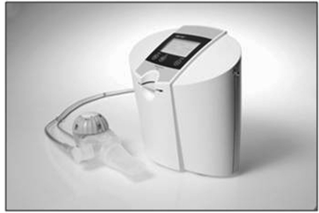
Fig. 2. AKITA®2 system with PARI APIXNEB nebulizer.

Currently, the AKITA® technology is the most advanced aerosol delivery technology as it is the only one that actively controls the entire inhalation manoeuvre of the patient. This is done by means of a positive air pressure delivered by a computer controlled compressor which is programmed on base of the patient's individual lung function data. By Activaero's SmartCard technology the lung function data can be submitted