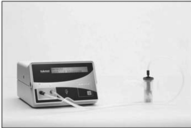
Fig. 1. AKITA® technology with Pari LC Star nebulizer.

Many existing inhalation devices are based on the bolus inhalation technique [3, 25]. For example, MDIs and DPIs are supposed to deliver the aerosol cloud at the beginning of a breath. This leads to a more efficient lung deposition than an inhalation of an aerosol over the entire inspiration because the clean air that follows the aerosol cloud transports the particles deeply into the lungs and extends their pulmonary residence time [2, 3]. Another commercially available system, the AERx® Pulmonary Drug Delivery System of Aradigm (USA) uses a bolus of aerosol particles that can be activated during a certain time point during an inspiration. The bolus is produced by a piston that empties a small liquid reservoir into the inhalation air. Other devices, like the AKITA® Inhalation System (Activaero, Germany; Fig. 1) and the I-neb® AAD® System (Philips-Respironics, Netherlands) use liquid nebulizer systems which are operated only at a certain time during an inhalation cycle and therefore also use the bolus inhalation technique to increase particle deposition in the lung [3].