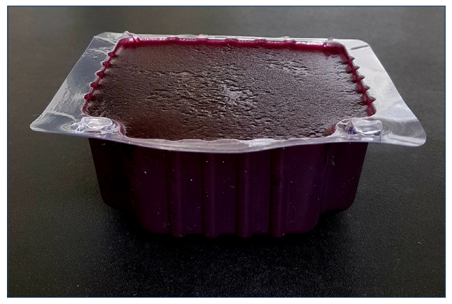
Figure 1. Close-up external view of the model. The target, which consisted of a grape embedded in the red elastic matrix, is not visible in this view.

The target was glued to the bottom of the container to prevent it from moving, thus eliminating the need for several phases of matrix layering (Figure 2).