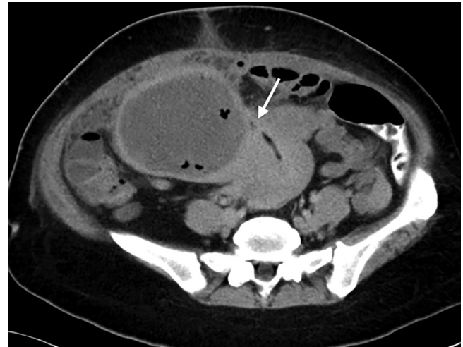
Fig. 3 – Axial reformatted contrasted CT Abdomen demonstrated a small communication track (white arrow) between the largest rim-enhancing mid-abdomen collection with the endometrial cavity indicative of a ruptured pyomyoma with fistula formation.

It can be multiple in up to 84% of women. Fibroids are hormonal dependent responsive to both oestrogen and progesterone. Their size can rapidly increase during pregnancy and generally shrinks after menopause. There is a high likelihood of red degeneration during pregnancy due to hemorrhagic infarction. Hyaline, cystic and myxoid degeneration are others known complication. Pyomyoma is a rare complication following a Caesarean section, and literature searches up to 2016 revealed only <100 reported cases since 1945 [7]. Pregnancy, the postpartum period, and uterine instrumentation procedures such as dilatation and curettage and Caesarean section have