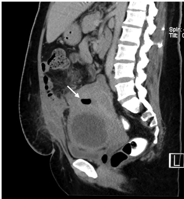
Fig. 2 – Sagittal reformatted contrasted CT abdomen revealed mild hydrometra and air locules (white arrow) within the uterine cavity. Additionally, there is a rim-enhancing collection along the anterior uterine body, along with intramuscular collections within the rectus abdominis muscles and subcutaneous fat stranding, suggestive of an active infection.