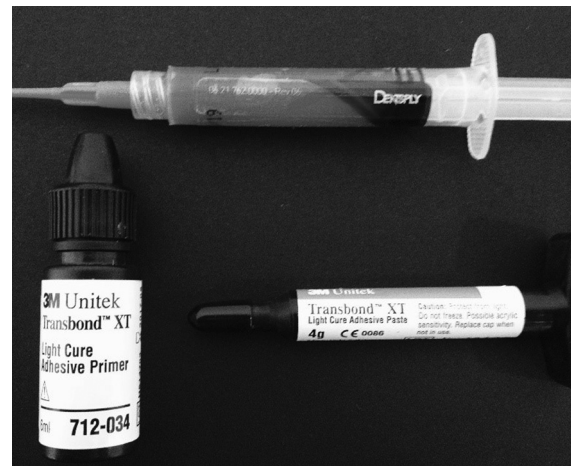
Fig. 1: Adhesive system for bonding brackets

After preparing the enamel samples, premolar brackets were bonded as prescribed by Edgewise Standart, slot .022" (Morelli Ortodontia, Sorocaba, SP, Brasil) using Transbond XT® (3M/Unitek) resin (Fig. 1). The amount