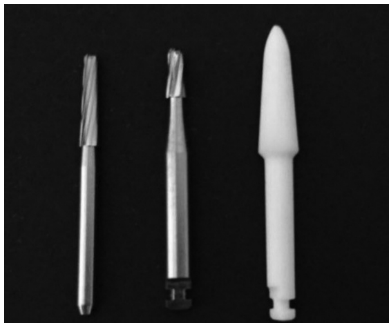
Fig. 2: Drills for removal of remaining adhesive.

(Orthometric, Marília, SP, Brasil); in group 2 by using a tungsten carbide 9-blade low-rotation drill #CB 27 (Orthometric); and in group 3 by using a Fiberglass® #2 TDV low-speed glass fiber drill (Fig. 2). In all three