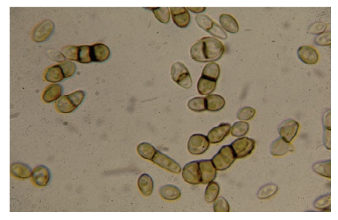
Fig. 4. Multiple blastoconidia with central septa (KOH, 40×). (case 20, CBS 122342; Table 1).

report that throughout the day a change in colour of the macules can be observed: early in the morning macules can appear in more intense pigmentations but they fade as the day goes by. This is probably due to the fact that the fungus is cleared from the hands as a result of daily activities. Only one patient in our study, presented with erythema, also reported moderate itching as was noted in other studies (Hughes et al. 1993, Perez et al. 2005).