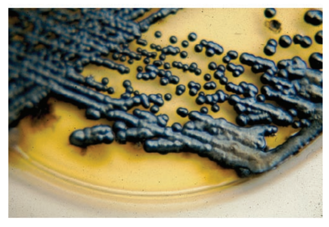
Fig. 3. Culture of Hortaea werneckii on SGA. Two phases: yeast-like phase with moist colonies, and filamentous colony (case 11, CBS 122344; Table 1).

The disorder has no preference for age categories (Table 1), cases equally occurring in adults and children, and no gender differences are observed (Durán et al. 1993, Pegas et al. 2003). Course of the infection according to our data was 1–18 mos, with a mean incubation time of 3.8 mos. According to the patient's information, we think that the developing lesions become visible within 15–30 ds. The lesions are invariably flat, not elevated and without inflamed margins; they consist of pigmented, mostly brownish, irregular and asymptomatic macules and with well-defined borders, and are covered by fine scaling. Some patients