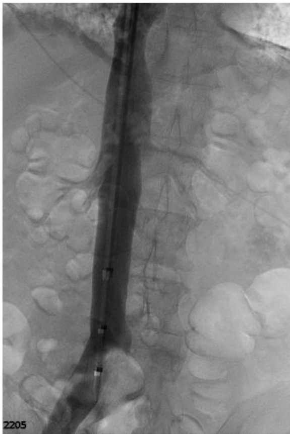
Figure 2 Venogram demonstrating occlusion of the left common iliac vein.

Patients with trauma to the lower extremities are in a high risk of developing DVTs. Young patients without other hypercoagulable risk factors who suddenly develop iliofemoral thrombosis should raise suspicion of an underlying MTS, but it may even occur in older patients as in our case. Those individuals need a more aggressive workup and require early endovascular intervention to prevent recurring DVTs or chronic venous insufficiency. An interdisciplinary approach should be favored.