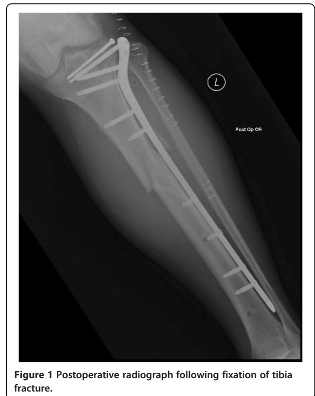
Figure 1 Postoperative radiograph following fixation of tibia fracture.

Diagnosis of MTS follows the general pathway of DVT diagnostics in the lower extremity. A clinical suspicion of a left or right lower extremity DVT should be investigated by obtaining duplex sonograms, although it is known to have limitations for iliac vein involvement.