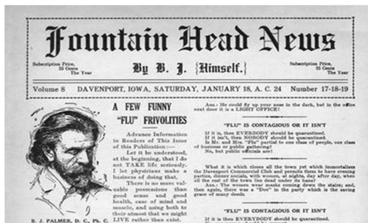
Fig. 1 Fountain Head News January 12, A.C. 24

One early prospectus for Palmer School of Chiropractic (PSC) sums up the position nicely –