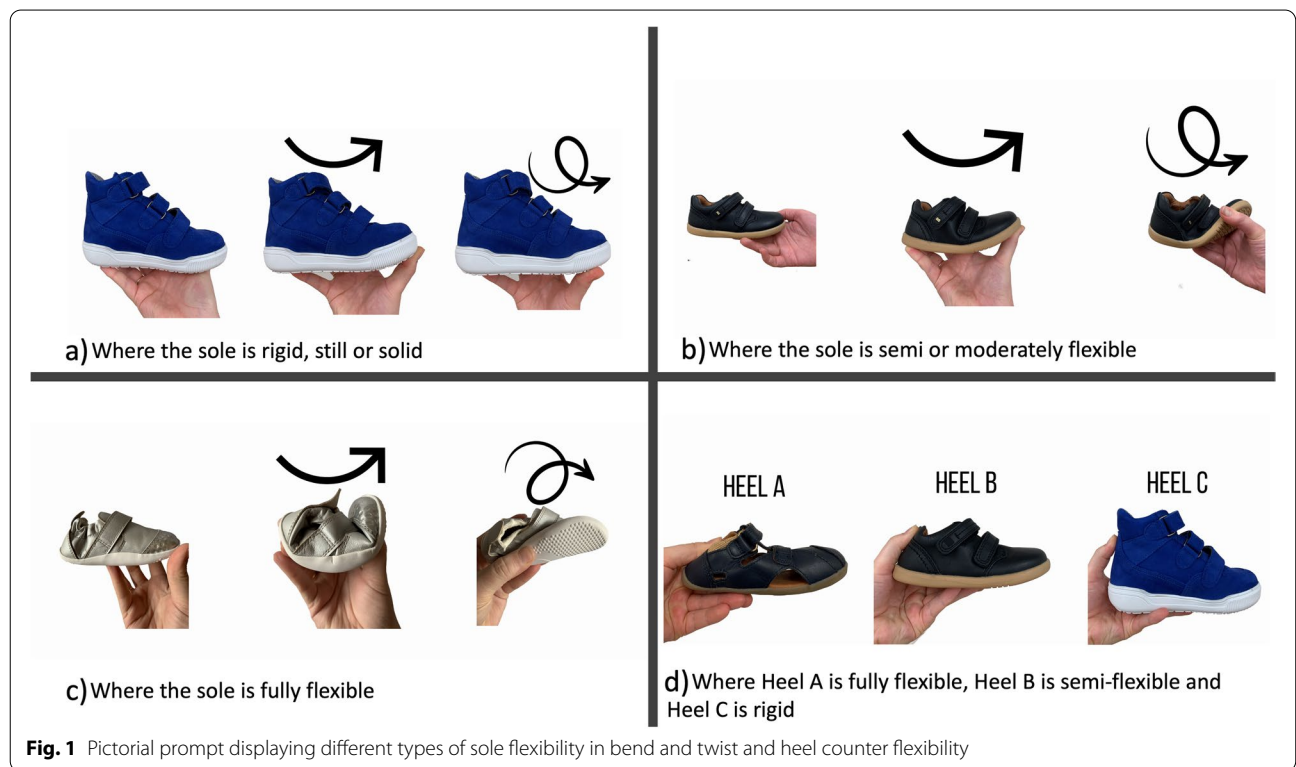
Fig. 1 Pictorial prompt displaying different types of sole flexibility in bend and twist and heel counter flexibility

Data were initially cleaned, and responses removed if participant did not fully complete questions about which stakeholder group they belonged to. Data were analysed in Microsoft Excel 2018 (Microsoft Corp, Redmond Washington). Participants were grouped in a hierarchical manner based on health professional