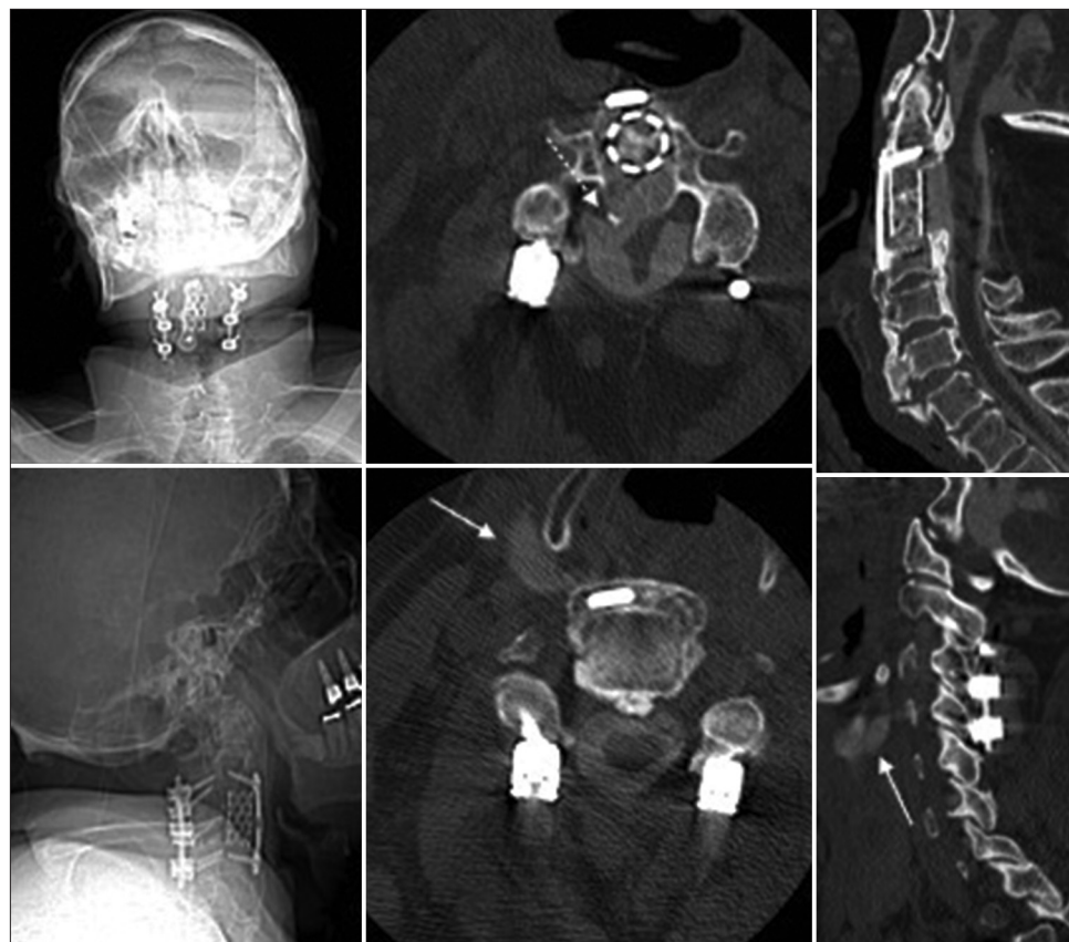
Figure 3: Coronal (upper left) and sagittal (lower left) scout images of the intact anterior corpectomy with titanium mesh cage, anterior plate and screw construct from C2-C4, and posterior laminectomy and fusion with transpedicular screws and interconnecting rods from C2-C4. Axial (upper middle) and sagittal (upper right) post-injection CT myelogram images demonstrating a ventral dural defect (dotted-line arrow) at level C2 with borderline spinal cord herniation and CSF throughout the corpectomy site and within the titanium mesh cage. Axial (lower middle) and sagittal (lower right) postinjection CT myelogram images showing a fluid collection in the right anterolateral soft tissues of the neck extending from the corpectomy site (solid-line arrows) at level C4.