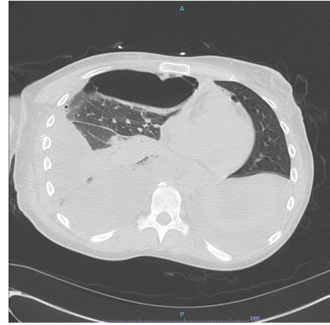
FIGURE 1: Computed tomography (CT) of the chest without contrast: moderate-large loculated right pneumothorax anteriorly with mediastinal shift to the left suggesting tension component and small volume pneumomediastinum.