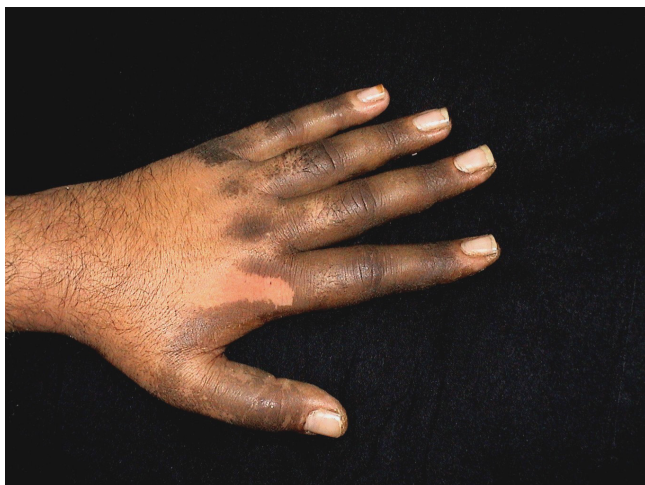
Figure 1 Dorsum of hand (at presentation).

Considering the history and clinical examination, a diagnosis of dermatosis neglecta was made. The area over the dorsum of the hand was cleaned with a methanol swab, revealing completely normal skin underneath. The patient was prescribed a keratolytic ointment for the palmer surface and advised to maintain better hygiene of the affected area despite the disability. Upon follow-up examination two weeks later, the hand was completely devoid of any pigmentation or verrucosity (Figure 2).