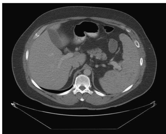
Figure 1 Multiple hypo dense lesion in the spleen.

spleen. Ascites, however, was absent. Histological examination of the spleen showed that the basic lesion was caseating granuloma composed mainly of epithelioid cells and Langerhans giant cells. Ziehl–Neelsen staining was positive for tubercle bacilli (Figure 2).