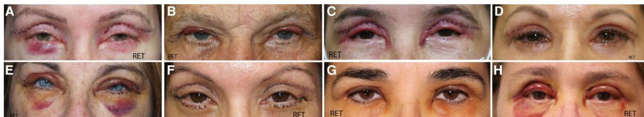
Figure 1. Typical results as reported by investigators. Each patient shown here underwent upper or upper and lower blepharoplasty (U/L Bleph). The side that received REST is designated as shown. All photos were taken at in first postoperative week. (A) A 56-year-old female patient who underwent U/L Bleph shown 1 day post-surgery; investigator reported markedly less bruising swelling on the REST side. (B) A 63-year-old male patient who underwent U Bleph shown 3 days post-surgery; investigator reported less swelling on the REST side. (C) A 56-year-old female patient who underwent U Bleph shown 1 day post-surgery, no difference reported. (D) A 56-year-old female patient who underwent U/L Bleph shown 7 days post-surgery; investigator reported slightly less bruising swelling on the REST side. (E) A 61-year-old female patient who underwent U Bleph shown 3 days post-surgery; investigator reported less bruising swelling on the REST side. (F) A 63-year-old female patient who underwent U/L Bleph shown 7 days post-surgery; investigator reported slightly less swelling on the REST side. (G) A 61-year-old female patient who underwent U Bleph shown 3 days post-surgery; investigator reported less bruising swelling on the REST side. (H) A 62-year-old female patient who underwent U Bleph shown 3 days post-surgery; investigator reported less bruising swelling on the REST side. REST, restorative eye treatment side.

different, as there is really no discomfort associated with upper-eyelid blepharoplasties.