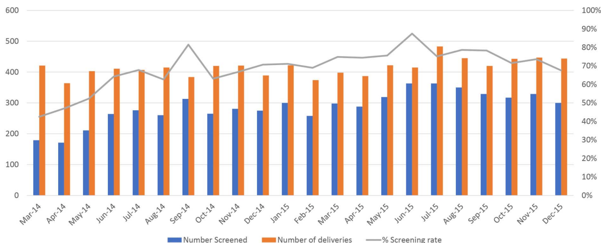
Figure 2 Monthly screening rates for group B Streptococcus infections (GBS).