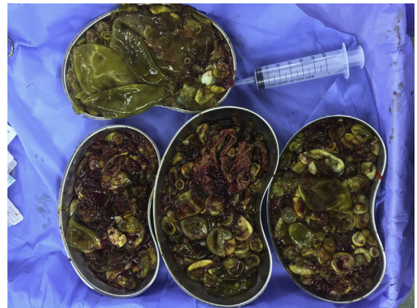
Fig. 5. A large number of daughter cysts extracted from the abdomen and the right lobe of the liver.

Hydatid disease should be one of the differential diagnoses in any cystic lesion of the liver and other organs [7].