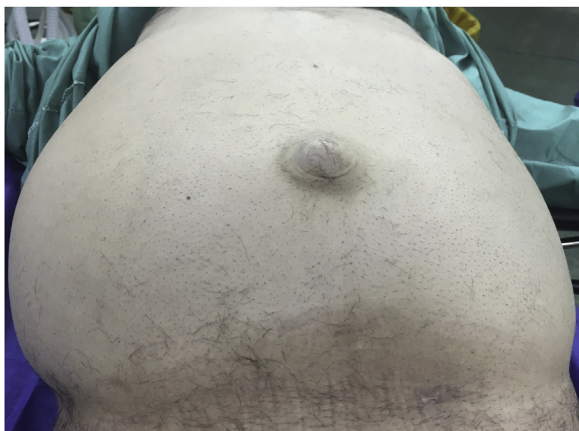
Fig. 1. A picture showing the abdomen of the patient with bulging in the right side of the abdomen and umbilical hernia.