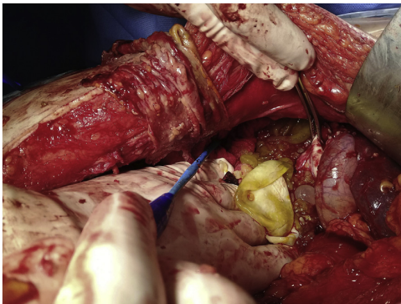
Fig. 4. An intraoperative picture showing a large number of daughter cysts in the peritoneal cavity.