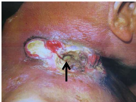
Fig. 1 Photograph of the affected area. The metastatic lymph node accompanied with necrotic tissue after irradiation in the right supraclavicular region destructively invades the surrounding cervical area of the patient. The right carotid sheath and arterial pulsation are confirmed in the cutaneous pocket under direct vision (arrow)

An angiogram showed a pathologic condition located at the midpoint between the origin of the right common carotid artery and the carotid bifurcation. The