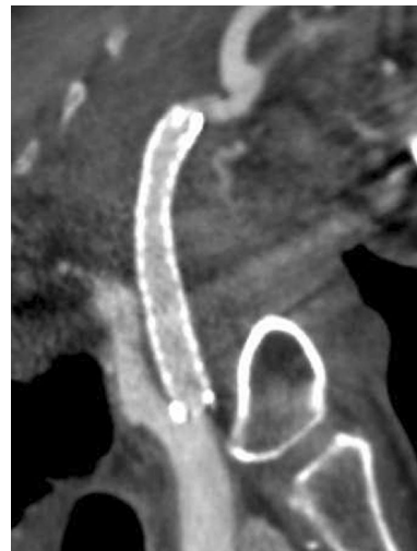
Fig. 5 Multiplanar reconstruction contrast-enhanced CT in a sagittal view 2 months after stent placement shows full expansion of the stent and favorable patency of the carotid artery

neurological morbidity and a 40 % risk of mortality (Citardi et al. 1995). Treatment for CBS includes surgery with resection and reconstruction of carotid artery ligation. Recently, endovascular procedures, including embolization with platinum coils and stent-graft placement, have also been useful for the treatment of a ruptured carotid artery. These procedures have many advantages over surgical techniques due to their high success rate, reduced invasiveness, and lower late complication rate (Pyun et al. 2007; Chang et al. 2007, 2008).