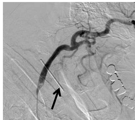
Fig. 3 Right carotid angiogram. Radiopaque marker indicating the location of the cutaneous pocket between the origin of the right common carotid artery and the carotid bifurcation is placed on the surface of the patient's neck (arrow)

The stent was deployed to fully cover the artery that the adjacent tumor had invaded and threatened to cause impending rupture, with reference to the body markers. The distal end of the stent was placed below the carotid