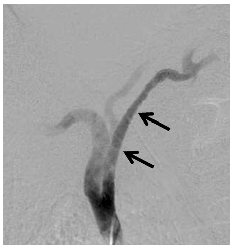
Fig. 4 A 60-mm-long, 10-mm-diameter covered stent graft, which protects the artery from direct invasion by the tumor, is deployed in the right carotid artery (arrows)

Especially in patients with advanced cancer, carotid artery rupture is life-threatening. Prompt treatment is required because patients with CBS have a 60 % risk of