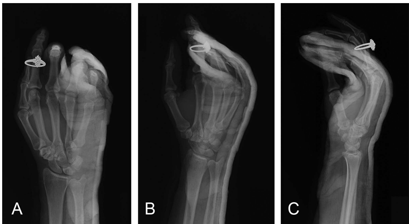
Figure 3. Postreduction right hand posteroanterior (A), oblique (B), and lateral (C) x-rays show adequate alignment of the fifth carpometacarpal joint.

ligaments. 16 The index and long finger CMC joints are very rigid, allowing only 1 to 3 degrees of motion, while the CMC joints have looser ligamentous attachments that allow for greater mobility. 17