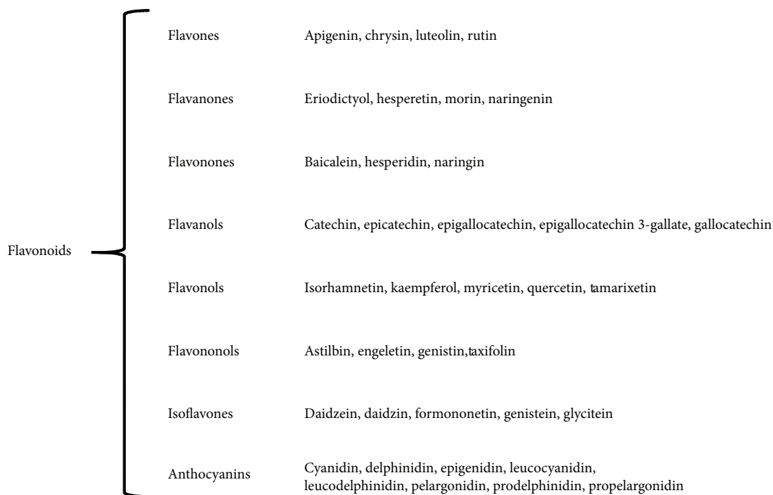
FIGURE 2: Classification of the eight foremost flavonoid subgroups.

naringin, and baicalein. In fact, the former two can be confused with similarly named compounds from the flavanone subgroup (see above) but constitute different compounds. As for all the polyphenols, the latter is metabolized by the GM [93, 95] and exhibits strong anti-inflammatory properties [79, 96, 97]. Additionally, these compounds also influence lipid metabolism as follows: hesperidin improves lipid metabolism against alcohol injury by reducing endoplasmic reticulum stress and DNA damage [98] and exhibits an antiobesity effect [99]; naringin also influences the lipid profile and ameliorates obesity [100], and finally, baicalein regulates early adipogenesis by inhibiting lipid accumulation and m-TOR signaling [101]. Again, there is a need for studies that take into account the following elements together, that is, GM metabolism of the polyphenols and their specific effect on lipid metabolism, obesity, and inflammation.