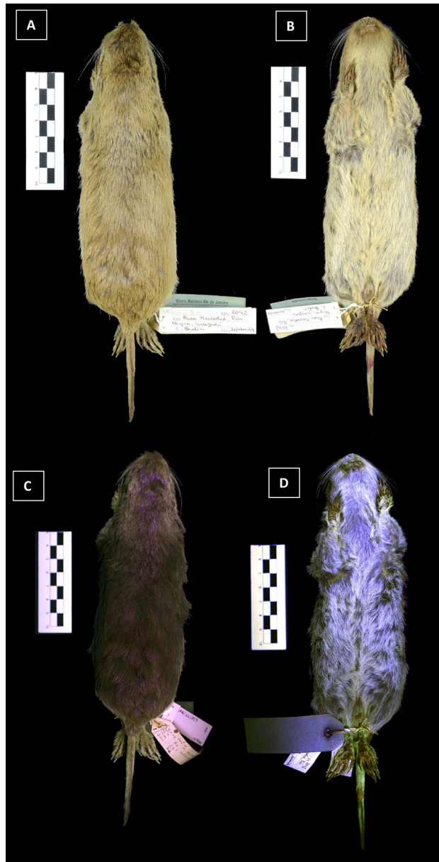
Figure 1. Photographs of Ctenomys torquatus (MN2042) under visible light (top row) and 395 nm ultraviolet (UV) light (bottom row). Dorsal (A, C) and ventral (B, D) views.

Hystrix (African porcupine), as well as Erethizon , Coendou , and Chaetomys (American porcupines), present quills along with their bodies. However, their quills differ significantly from each other in terms of mechanical properties, structure, and function 27,38 . Some of the Hystrix quills are classified as true quills, which are thicker, sharper, and used for defence 39,40 . Additionally, its quills are longer, stiffer, and more resistant than the quills of American porcupines, which may explain why we did not observe the same pattern in the three genera cited above. Our findings contradict that of Hamchand et al. 28 , who did not find measurable fluorescence in Hystrix javanica or Erethizon dorsatum . We believe that keratinisation is a possible explanation for the green colour we witnessed, and we suggest that keratinisation is different for each species. However, keratinisation may not be the sole explanation for green UV reflectance, as Reinhold 8 witnessed green fur in Rattus and Tumilson and Tumilson 15 in the underfur of Myocastor . Additionally, the work of Hamchand et al. 28 sheds light on the role of bacteria that biosynthesise and excrete porphyrin, a likely explanation for the red present in hedgehogs, but also the orange anogenital region of Chaetomys that we found.