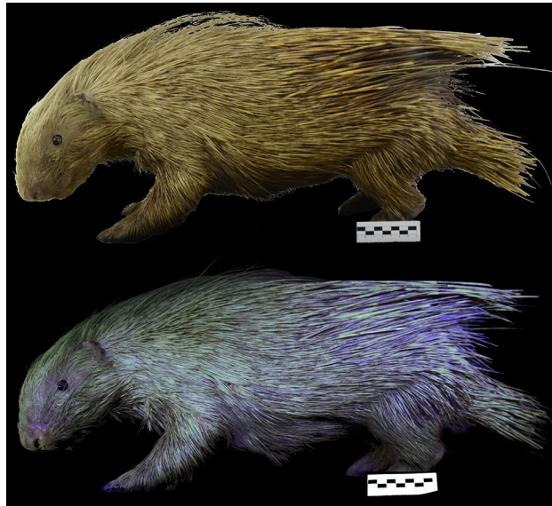
Figure 2. Photographs of Hystrix javanica (MN306) under visible light (top row) and 395 nm ultraviolet (UV) light (bottom row).