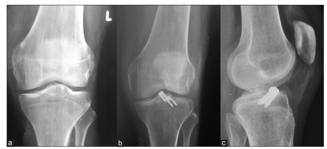
Figure 3: (a) Anteroposterior X-ray of left knee of a 39 years old male shows large ACL avulsion; (b) postoperative anteroposterior and (c) lateral view of the same patient shows ACL fixed with 2 staples