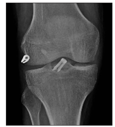
Figure 6: Anteroposterior X-ray of the right knee showing back out of the staple in a 26 year old male

In our study the mean IKDC score was 91.1(77 to 100) and the mean Lysholm score was 95.4 (83 to 100) which is comparable to other series in the literature [Tables 2 and 3]. The mean IKDC score in the seven patients with associated injuries was 90.3 which was comparable to the total series mean score of 91.1 and a mean Lysholm score of 94.4 which was comparable to the total series mean score of 95.4 [Table 1] predicting that presence of associated knee