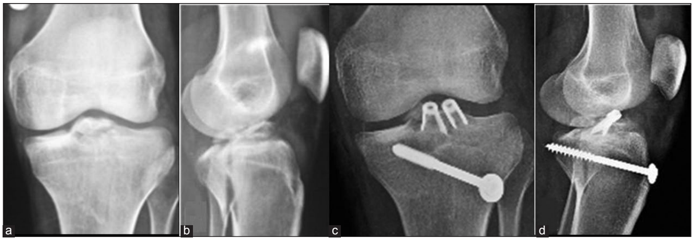
Figure 4: Anteroposterior (a) and lateral (b) radiograph of the right knee of a 35 year old female shows ACL avulsion and posterior tibial condyle fracture fixed respectively with staples (c,d) and percutaneous cancellous screws