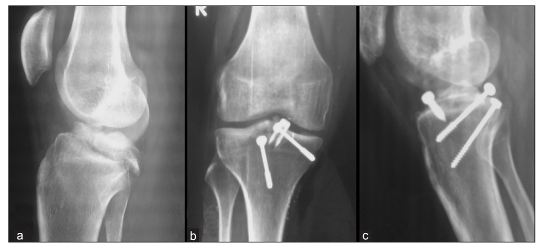
Figure 5(a-c): ACL and PCL avulsion fracture of the right knee in a 47 year old male fixed with screws for PCL and staples for ACL