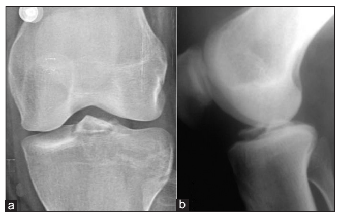
Figure 1: Plain radiograph anteroposterior (a) and lateral view (b) of right knee of a 28 year old man with ACL avulsion fracture

All patients underwent arthroscopic staple fixation. Under tourniquet control knee joint was examined by standard medial and lateral para patellar arthroscopic portals. The medial portal was higher than the lateral portal and in a more vertical position to facilitate the staple fixation [Figure 2]. Sometimes an additional higher lateral portal was needed to fix the fragment from lateral side. Thorough wash was given to drain the hematoma and the avulsed ACL fragment was visualized [Figure 2b] and it was made sure that there was no meniscal interposition. The titanium