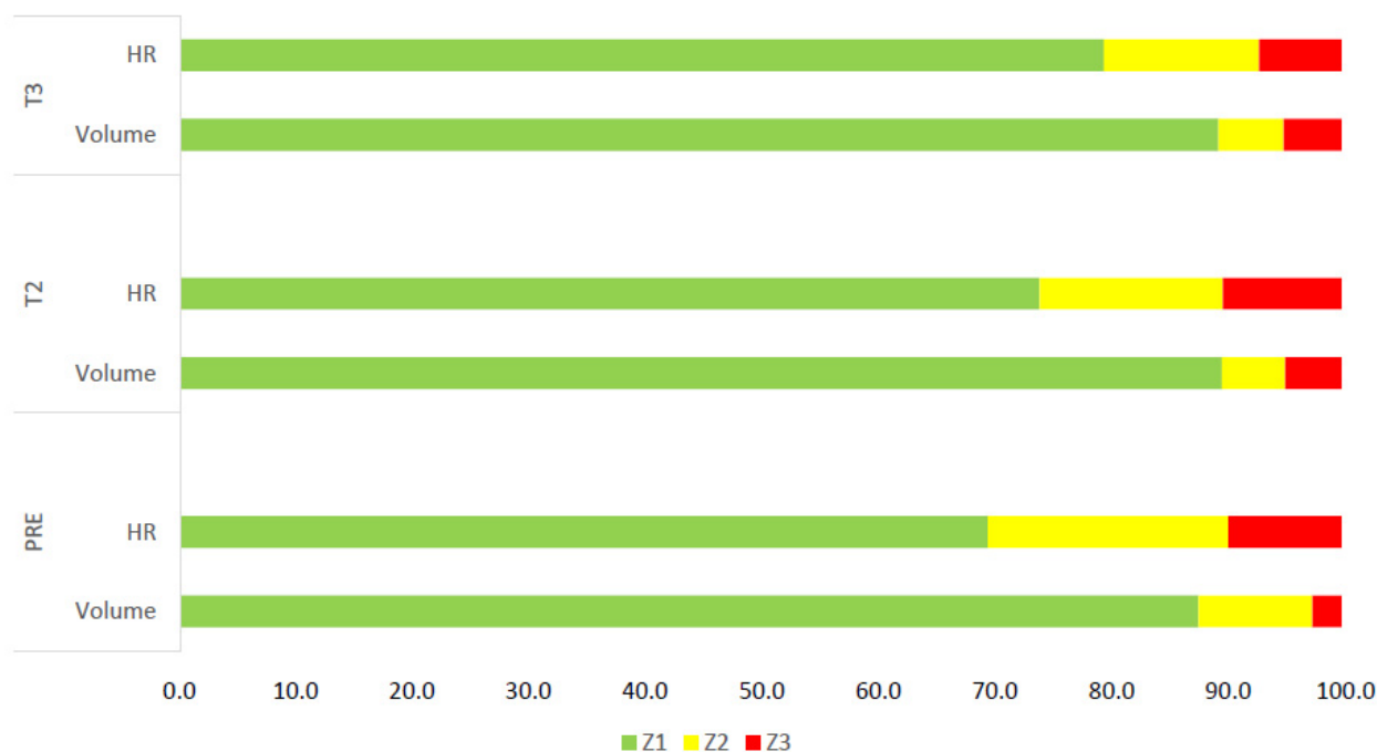
Figure 2. Training intensity distribution using training volume, expressed in km, and HR during PRE, T2, and T3. All values are expressed as % of training/time sessions. HR, heart rate.