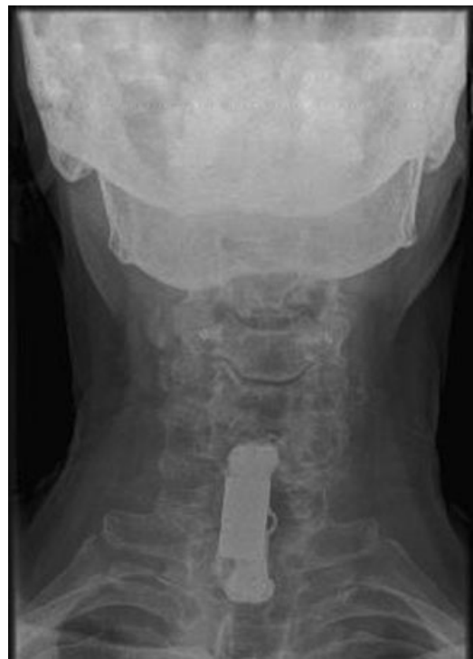
Fig. 5 Postoperative anteroposterior radiograph showing position of the implants and cement augmentation.

axial neck pain. The addition of an instrumented fusion procedure would have increased stability and may have led to improved neck pain. When considering additional posterior stabilization, the risk remained of postsurgical kyphosis if the patient were to survive longer than expected, and the authors were also concerned about the morbidity and infection risk associated with posterior approaches.