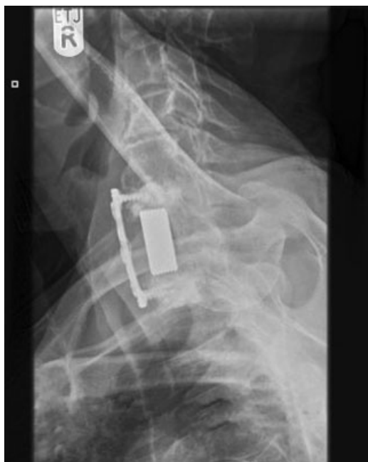
Fig. 4 Postoperative lateral radiograph showing position of the implants and cement augmentation.

Treating this patient with posterior decompression through laminectomy or laminoplasty alone may have relieved neurologic compression but likely would not have addressed his