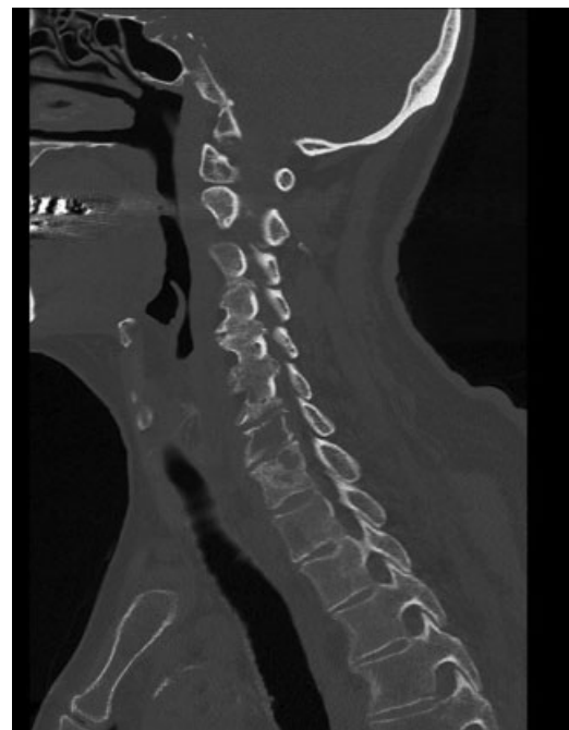
Fig. 3 Additional sagittal computed tomography of the cervical spine demonstrating further lytic destruction of the T1 vertebral body.

inserted to regain stability. Using the same approach, anterior cervical kyphoplasty trocars were inserted into C6 and T1. Bone tamps were inflated to 400 psi. Cement augmentation was then performed under fluoroscopic guidance. At T1, an oblique beam allowed for best visualization as the cement was inserted. An anterior plate was applied during the 18