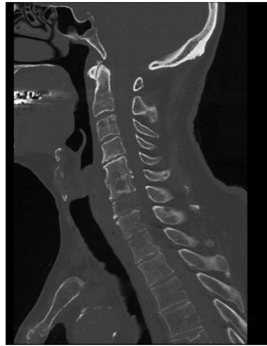
Fig. 2 Sagittal computed tomography of the cervical spine showing large lytic lesions in C6 and C7 vertebral bodies.

inserted to regain stability. Using the same approach, anterior cervical kyphoplasty trocars were inserted into C6 and T1. Bone tamps were inflated to 400 psi. Cement augmentation was then performed under fluoroscopic guidance. At T1, an oblique beam allowed for best visualization as the cement was inserted. An anterior plate was applied during the 18