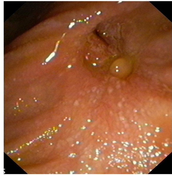
Figure 3 Endoscopic image of the papilla 6 months after treatment, depicting good local control of the lesion.

curative in 71 to 97% of patients with localized disease (pathologic stage pT1-2), whereas 5-year cancer-specific survival rates after nephrectomy decrease to 20 to 53% for patients with locally advanced tumors and below 15% for patients with metastatic disease [7]. Respectively, the rate of recurrence, even in cases of resection with curative intent, is high, ranging from 20 to 30%. It is estimated that, in total, 50% of the patients with renal carcinoma will present with or eventually develop metastatic disease [8]. Adjuvant therapy consisting of IL-2 and IFN- \alpha , which was