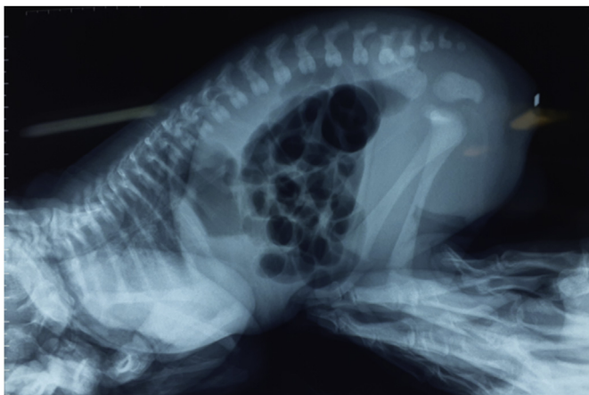
Figure 2. A plain cross-table lateral x-ray film with the newborn in prone position.

c) grade 3, constant soiling with social problems. In this classification, constipation includes: a) grade 1, manageable by changes in diet, b) grade 2, requires laxatives, and c) grade 3, resistant to laxatives and diet [6].