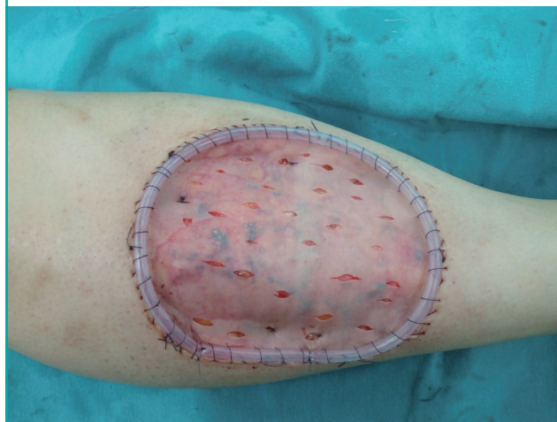
Fig. 4. The tie-over dressing with the silicone tube

After skin grafting, a silicone tube was placed on the over the wound margin and skin graft.