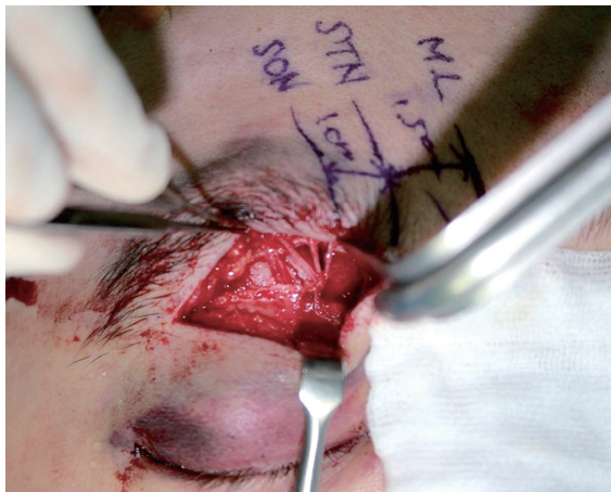
Fig. 1. Preoperative marking at 1.5 cm and 2.5 cm from the midline (ML) to avoid an injury of the supratrochlear and supraorbital nerves (STN, SON) and vessels. STN and SON are identified and preserved at the marked areas.

A bicoronal approach has been considered the standard approach in craniofacial surgery for many years. Patients who require obliteration or cranialization procedures require a bicoronal incision. Although a bicoronal incision offers adequate exposure, it requires a longer operative time and hospital stay. It has severe dis-