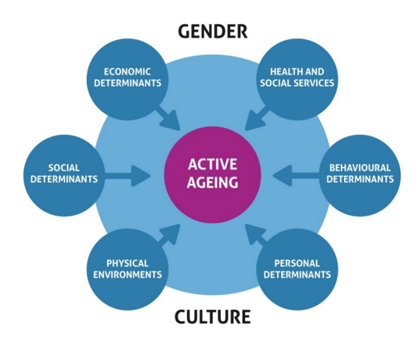
Figure 1. Determinants of active ageing. Source: [7].

The concept of age-friendly cities (communities), represents a place that encourages active aging by optimizing opportunities for health, participation and security in order to enhance quality of life as people age. It is a place that works to improve the livelihood of people of all ages [6]. Active ageing is a multi-dimensional discipline, with many determinants (Figure 1) and which requires that careful attention be paid to each determinant given their vital contributions to the ageing process.