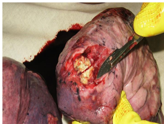
Figure 3: Postmortem specimen of lung parasitic metastases in a 38-year old female patient