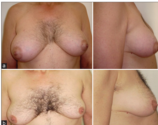
Figure 1: (a) Clinical aspect of gynecomastia under flutamide, (b) After stopping flutamide: Increase in body hair, and decrease in breast size

The mechanism of bilateral gynecomastia is generally represented by androgens deprivation, or by a tumor