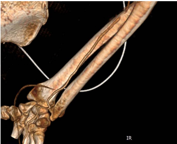
Figure 3: CT angiography of the right upper limb with volume rendering showing complete radial artery thrombosis beginning at the level of the elbow at the same level that embolectomy was performed. Also, there was significant ulnar artery stenosis near occlusion, ~15 cm proximal to the wrist. The ulnar artery appeared to be normal peripherally to the level of obstruction, with no collaterals being visible.

COVID-19 or as consequence of the systemic inflammatory response syndrome or even triggered by the use of intravascular catheters [8]. Results from autopsy studies in patients who died from COVID-19 infection revealed the presence of generalized thrombotic microangiopathy mainly affecting elderly male individuals with obesity and cardiovascular comorbidities.[9] However, arterial events presenting as acute limb ischemia have