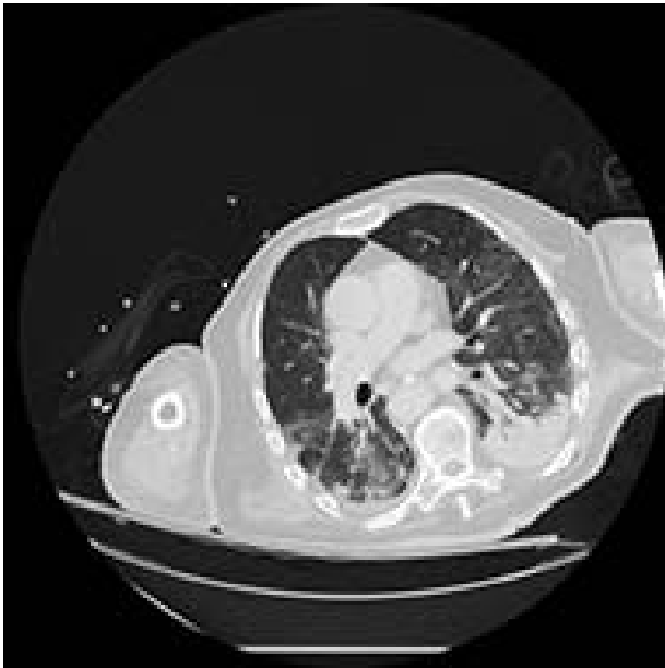
Figure 1: CT of the chest showing bilateral multiple ground glass opacities and areas of consolidation consistent with COVID-19 pneumonia.