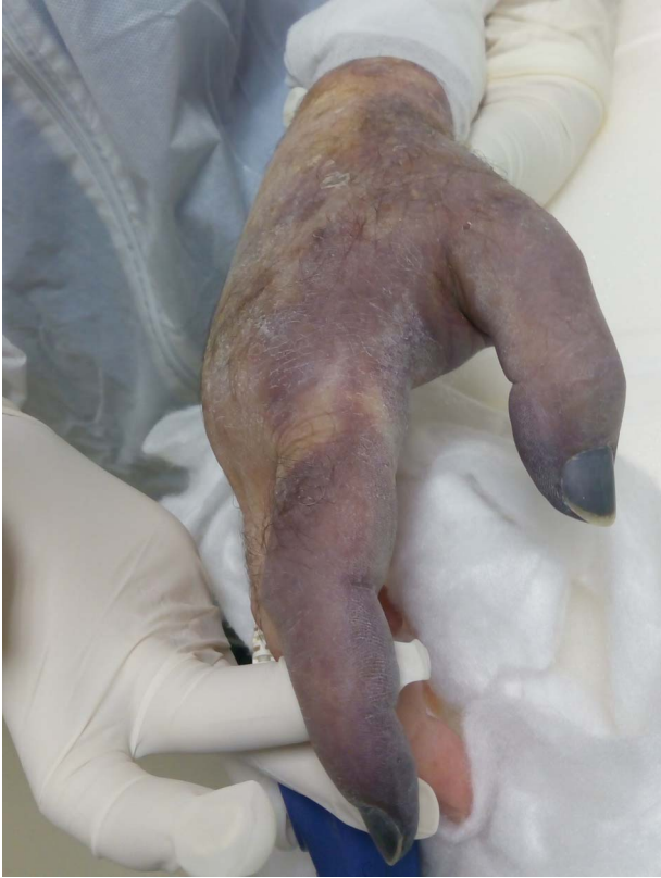
Figure 2: Dry gangrene of the right thumb and index fingers.