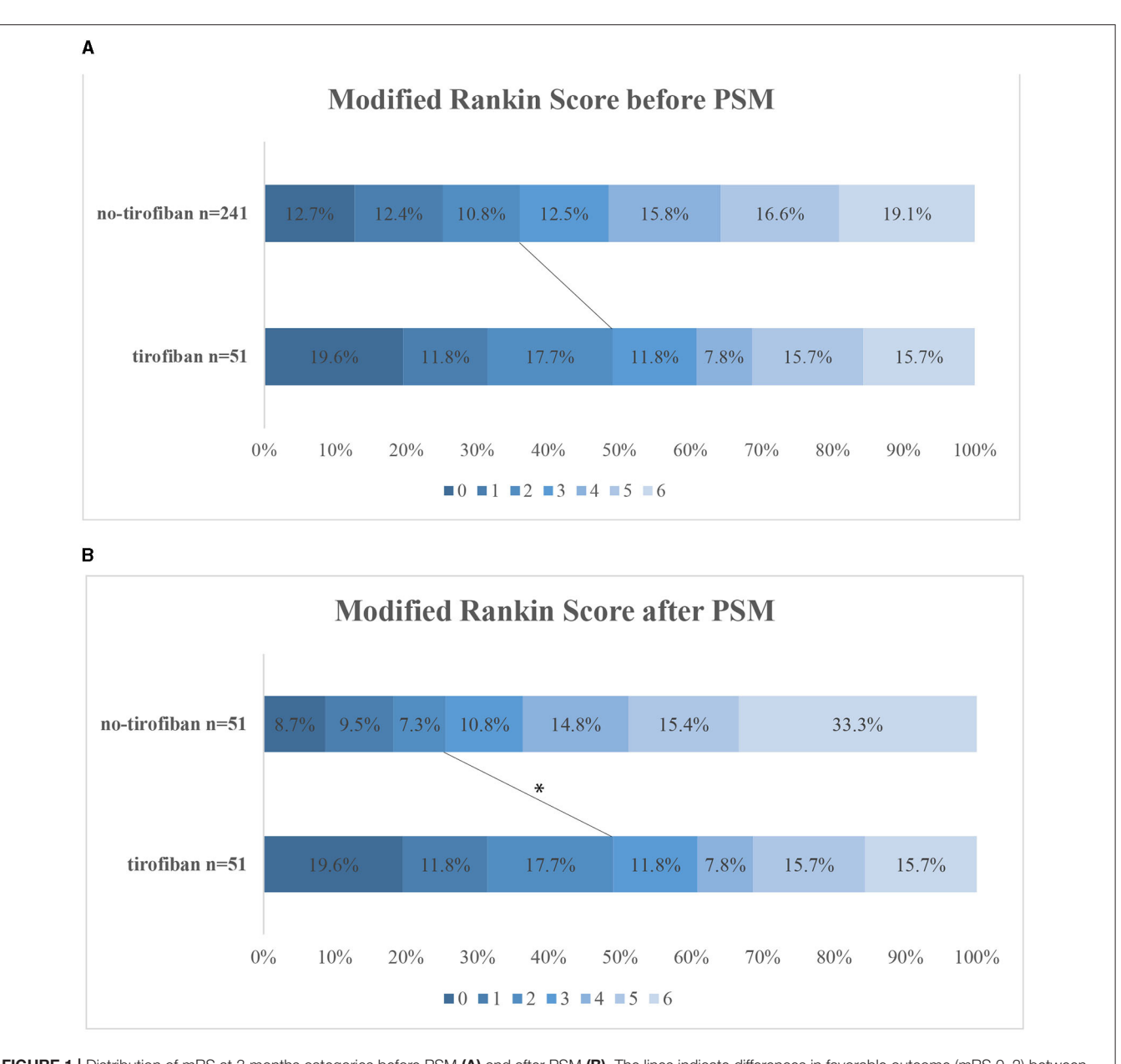
FIGURE 1 | Distribution of mRS at 3 months categories before PSM (A) and after PSM (B). The lines indicate differences in favorable outcome (mRS 0–2) between groups. p < 0.05. mRS, modified Rankin Scale; PSM, propensity score matching.