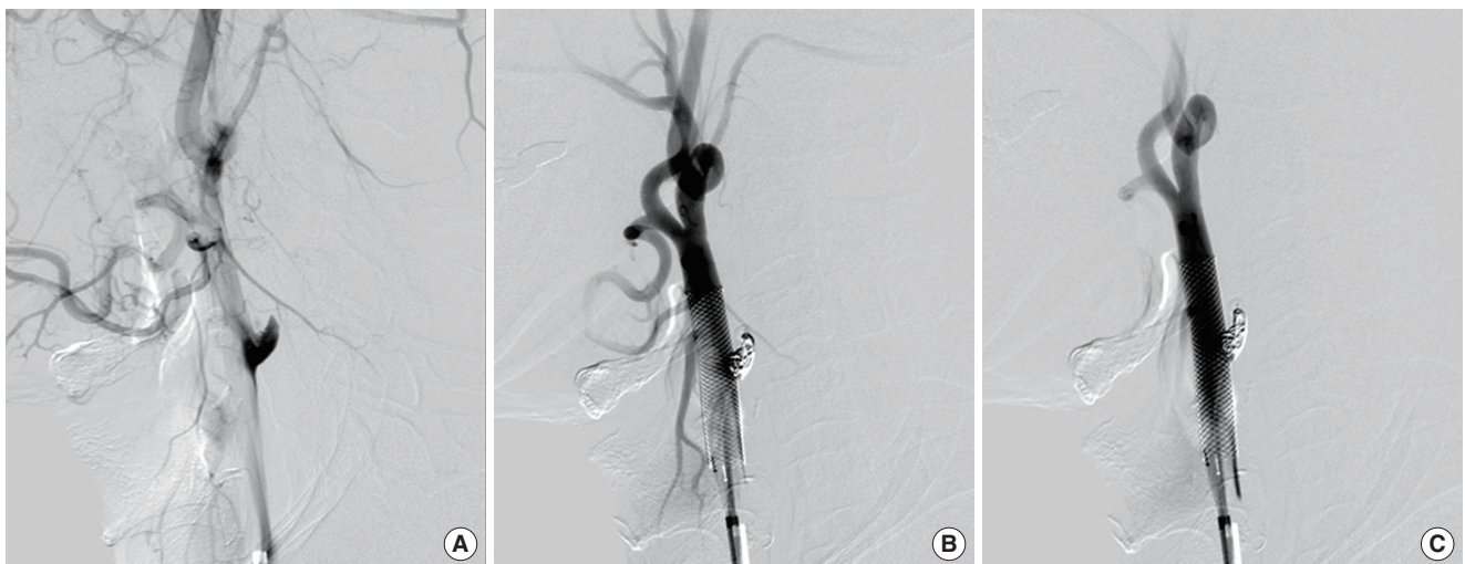
Figure 2. Conventional angiographic findings. (A) Cerebral angiography revealed turbulent flow in the left carotid stump. (B) Stenting and stent-assisted coiling were performed across the origin of the left internal carotid artery. (C) No residual stump on postprocedure angiography.