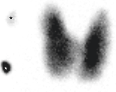
FIGURE 2: Radioiodine scan showing intense increased thyroid uptake, consistent with hyperthyroidism.

minute (Figure 3), and transvenous pacing lead was removed. She was discharged with medications for hyperthyroidism without the recurrence of the AV block.